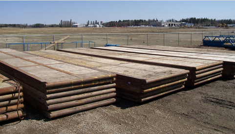
8' X 20' or 8' X 40' - 3 or 4 Beam Rigmats