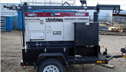
20 Kw Portable Light Towers