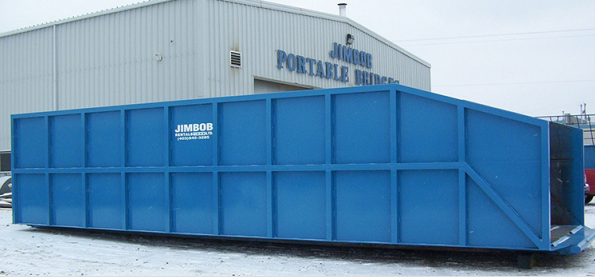
High Wall Open End 10' or 12' Wide X 40' Long