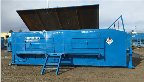
Environmental Refuge Bin