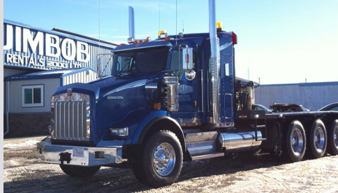
T800 Tri Drive Texas Roll