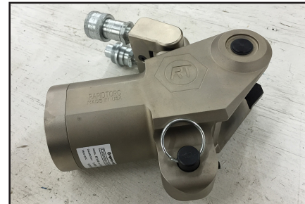
RTX 8 1143 to 8151 ft. lb.