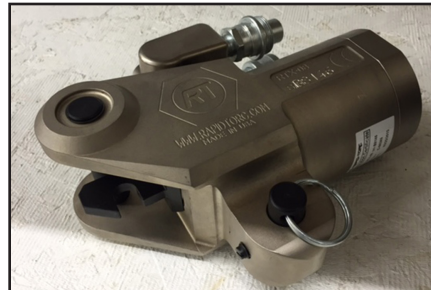
RTX 4 580 to 3855 ft. lb.