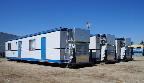
Portable Mobile Structures 50/50 Command Centre Units