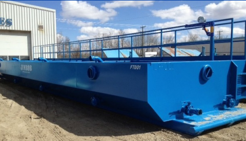
Floc Tank 400 Barrel Capacity 4' X 12' X 60'