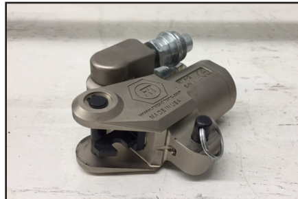
RTX 2 255 to 1710 ft. lb.