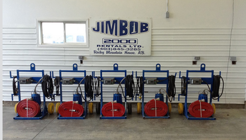
2" Electric Trash Pump - 100' Discharge Hose