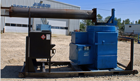
500,000 BTU - Type 1, 2 and 3 Waste