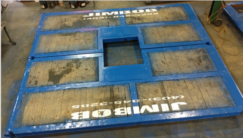
2 - 8' X 20' Mats with 4' X 4' Opening for Wellhead