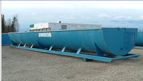
400 Barrel Capacity - 50' Long X 10' Wide X 5' High