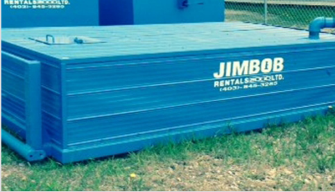
Sewer Tank with Sloped Design for Easier Removal and Cleaning