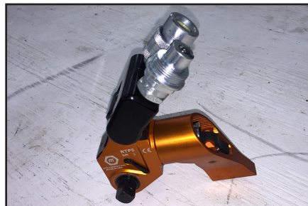
RT - 0.5 55 to 397 ft. lb.