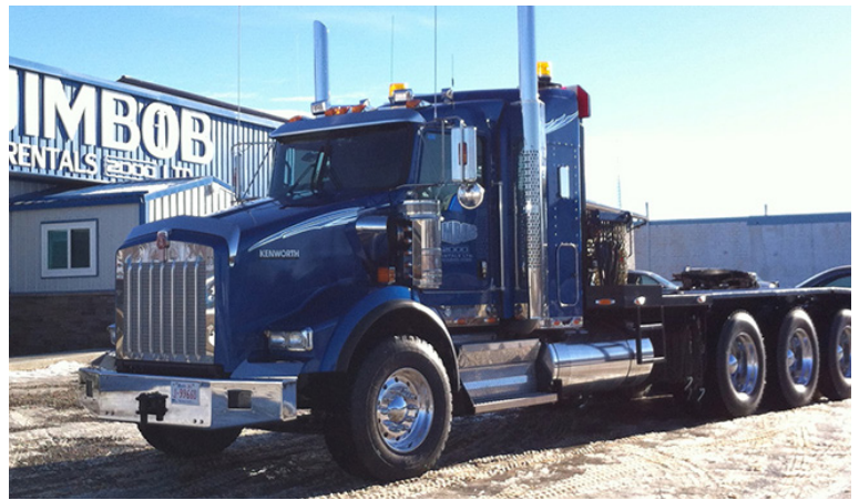
T800 Tri Drive Texas Roll