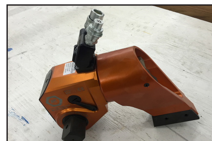
RT - 8 1200 to 8000 ft. lb.