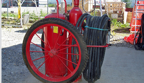
Portable Fire Extinguishers