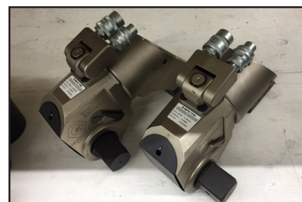
RT - 5 835 to 5590 ft. lb.