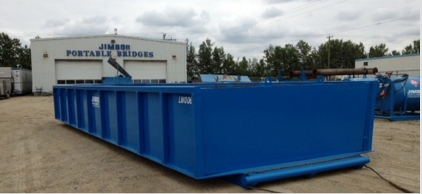
Low Wall Shale Bin - 12' X 40' Enclosed