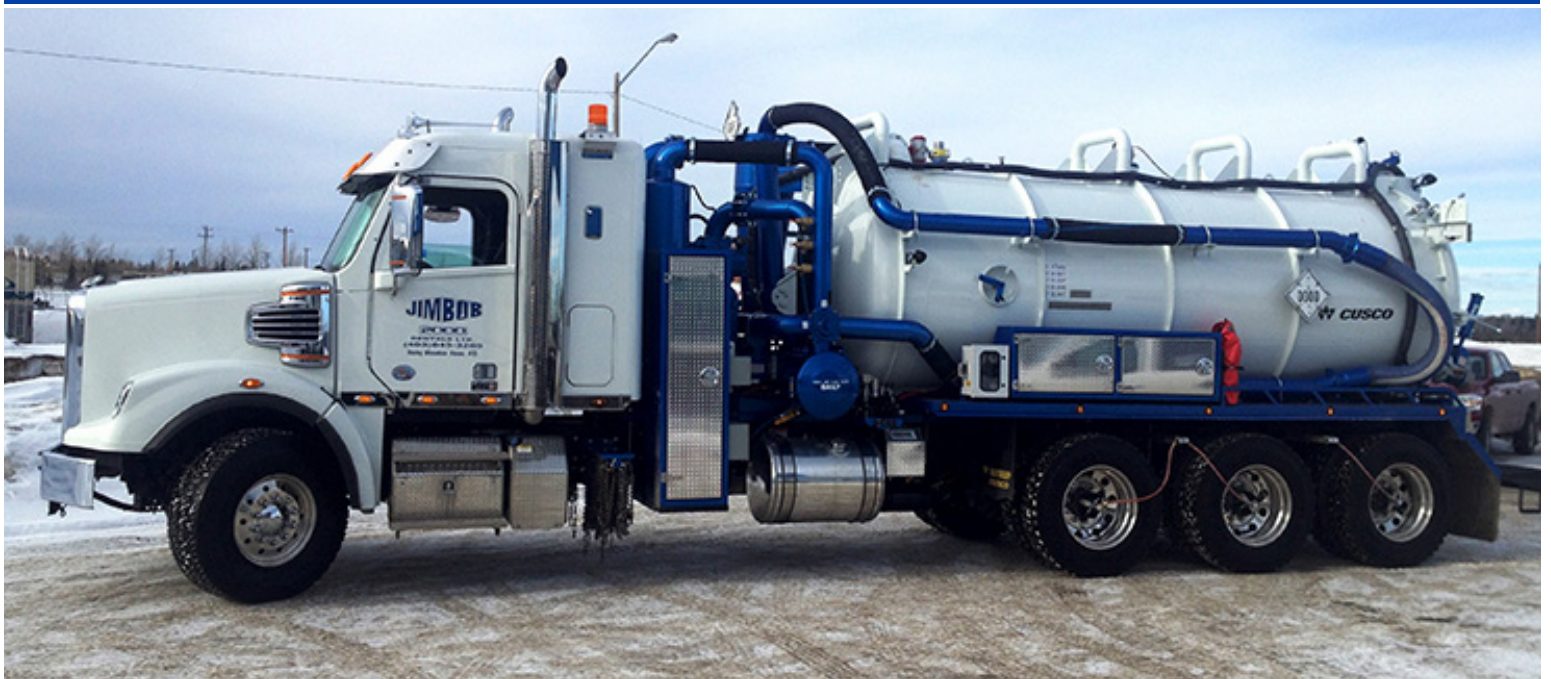
Cusco Dot Durovac 820 - 16 Cube Unit