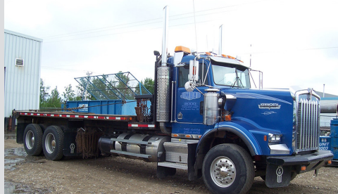
T800 Tandem Texas Roll