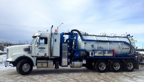
Cusco Dot Durovac 820 - 16 Cube Unit