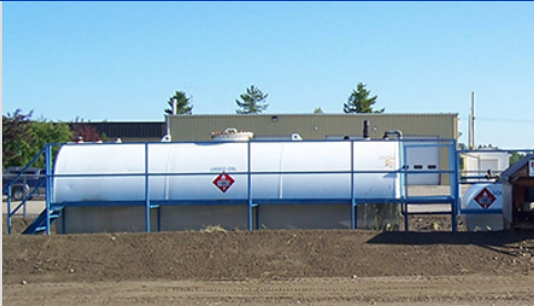
Environmental Recycle Station