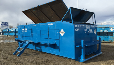
Environmental Refuge Bin