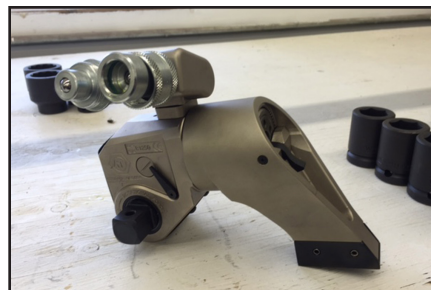
RT - 1 200 to 1340 ft. lb.