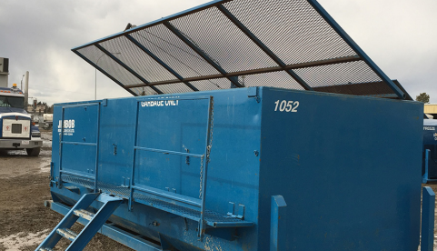
Garbage and/or Steel Bin