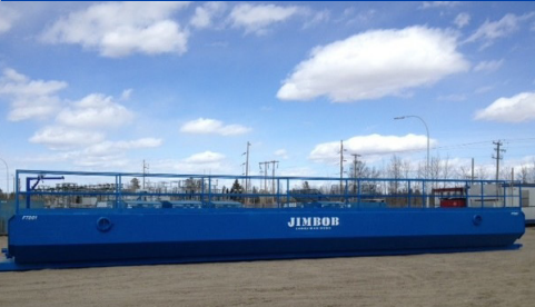
Floc Tank 400 Barrel Capacity 4' X 12' X 60'