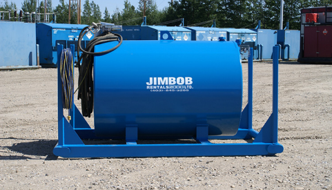
2500 Litre Capacity with Electric Pump - Skid Mounted