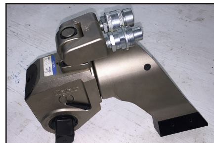
RT - 3 480 to 3230 ft. lb.